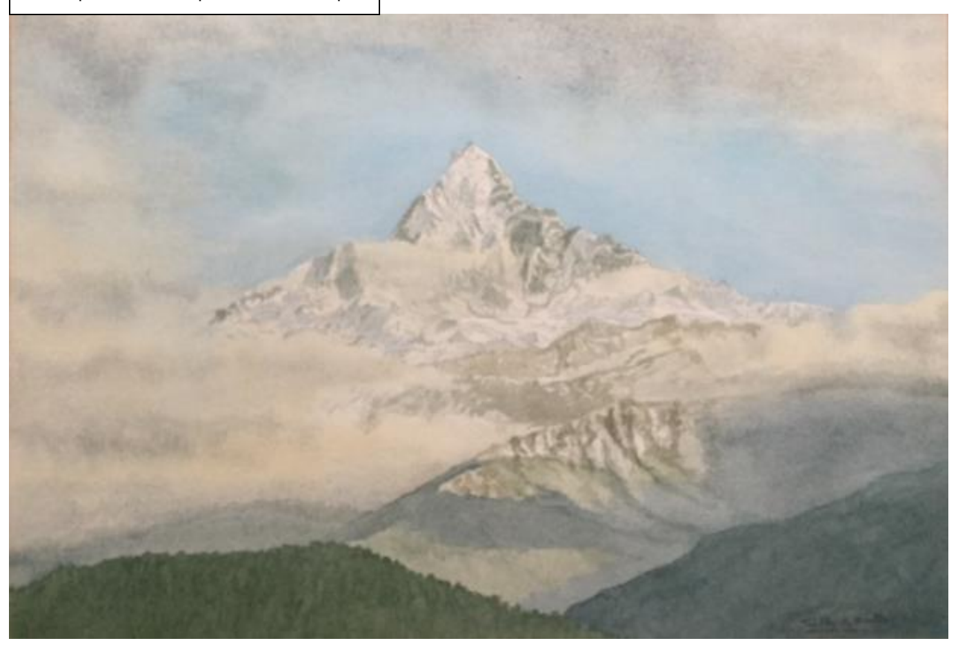
Nilgri from Syangboche, Mustang, Nepal