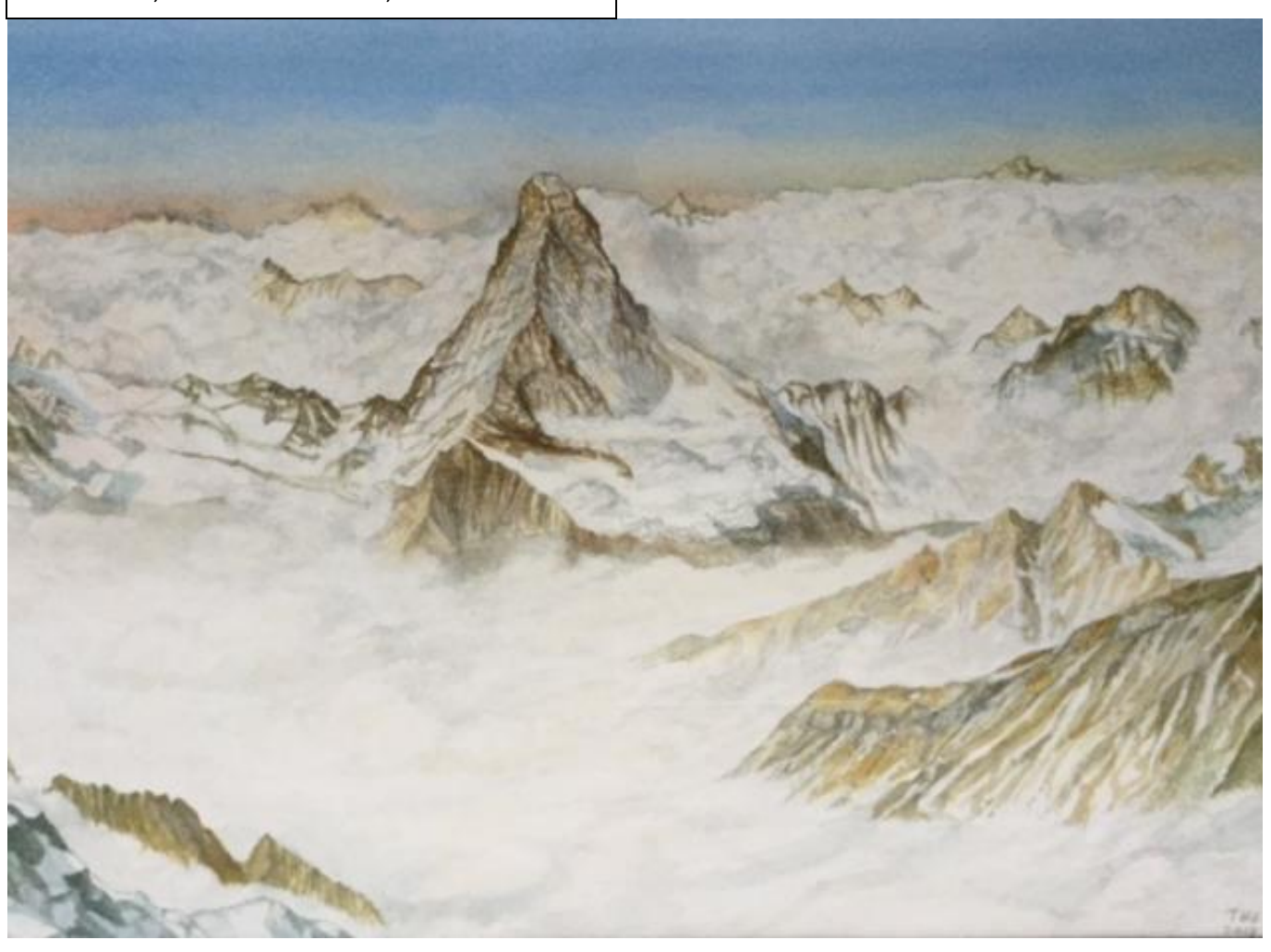
Weisshorn, climbed in 1956

Matterhorn, from the Nadelhorn, climbed in 1956